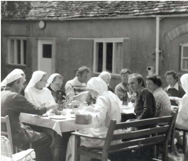
A work group from Cockfosters outside 'The Bungalow' at the Abbey 1980

During 1980 the Abbey was in the hands of the builders, and some of the sisters travelled regularly from Cockfosters to work at the Abbey, mainly doing demolition work—ideas as to what was suitable clothing for work underwent a transformation, gone were the white collars that were worn with black overalls!